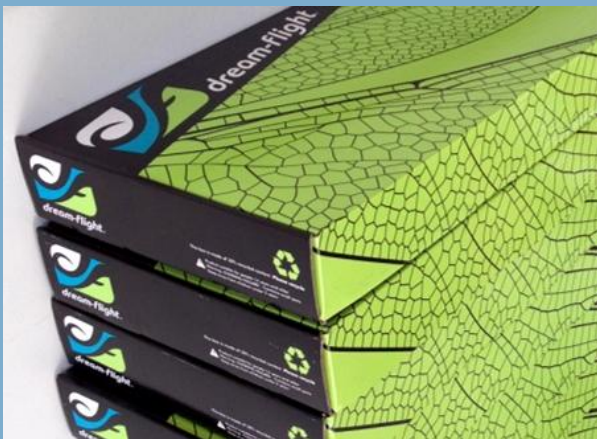
Inspiring, informative, and efficient packaging provides a highly professional offering at the retail level.