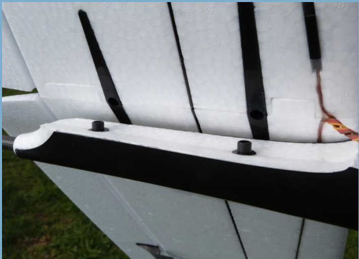
Interlocking wing and fuselage ensures easy assembly and distributes disc launching side loads.