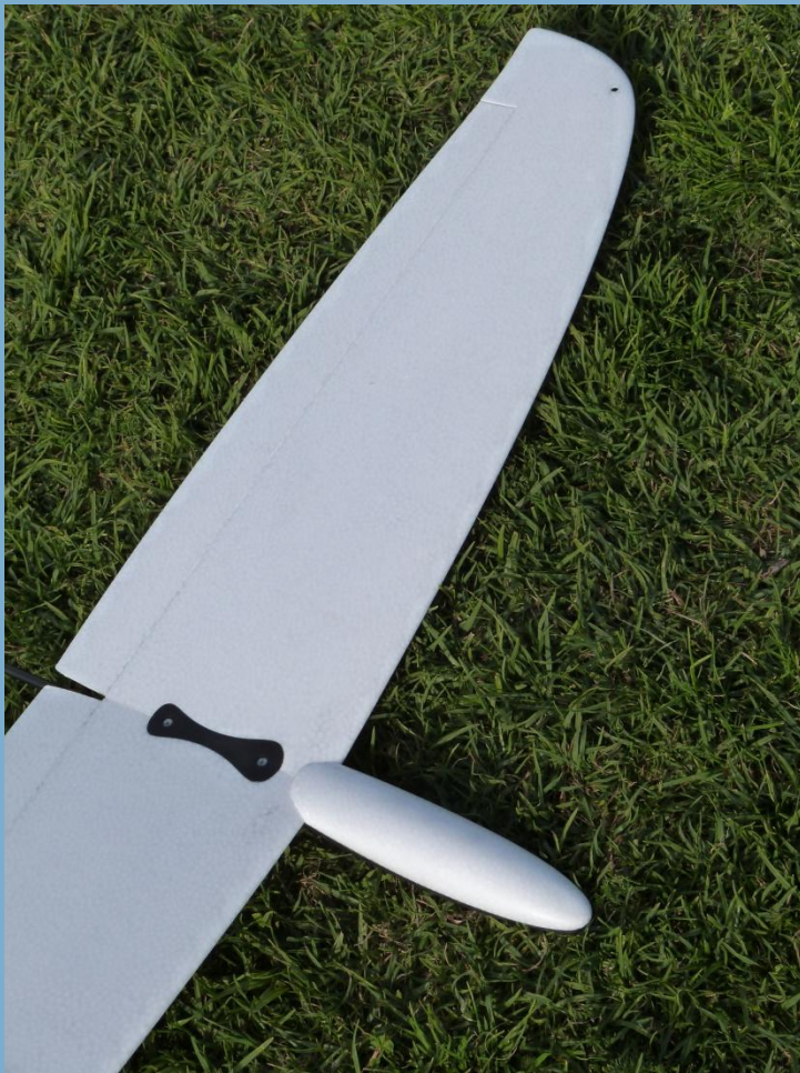
New molding capabilities produce the smoothest flight surfaces ever offered by Dream-Flight!