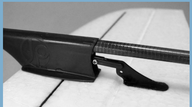
Carbon fiber tail boom provides a sturdy platform for the unique stabilizer mount with integrated pushrod housing. New adjustable clevis and control horn design produces a secure and low friction linkage.