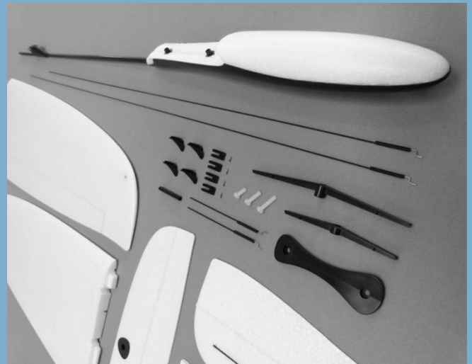
Highly prefabricated, the Libelle kit's low part count gets pilots soaring quickly.