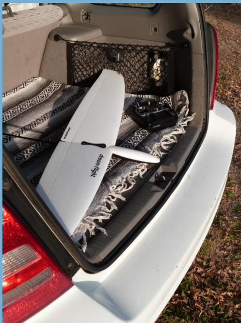
Compact, yet highly efficient 1.2m wingspan makes for easy transport.