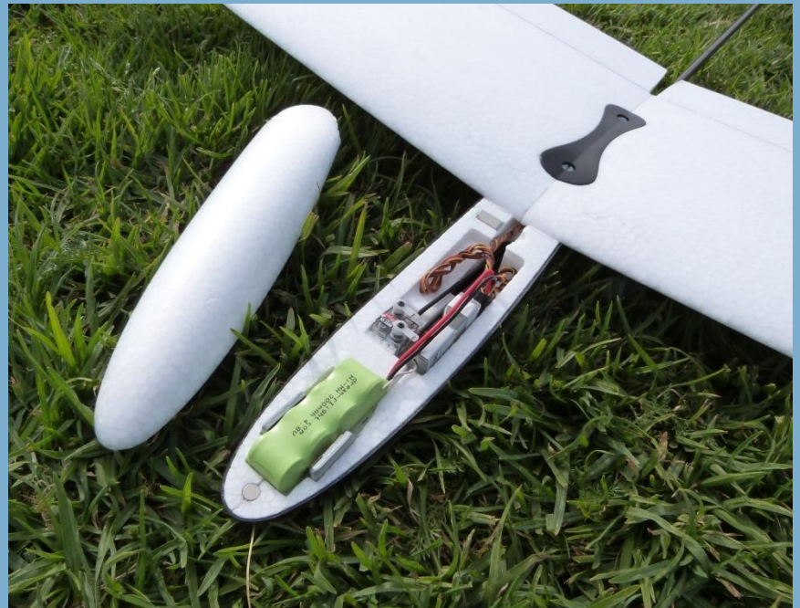
Factory installed magnetic hatch provides easy access to your radio compartment.