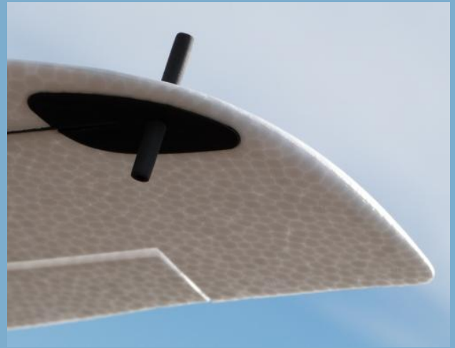
Integrated carbon fiber spars and molded wingtip launch plates provide a light and strong wing design capable of withstanding the rigors of discus launching.